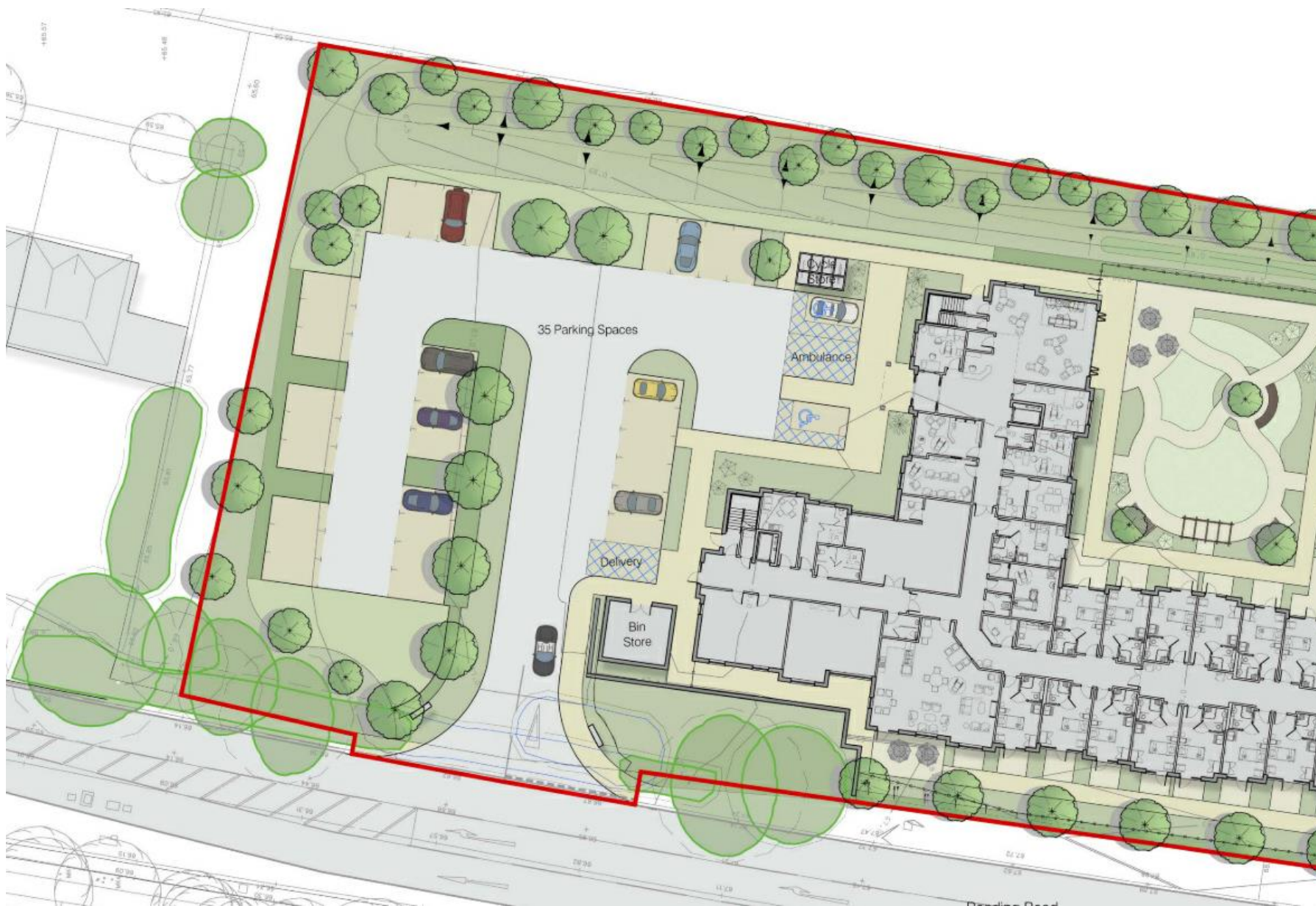
PROPOSED SITE PLAN (northern half)