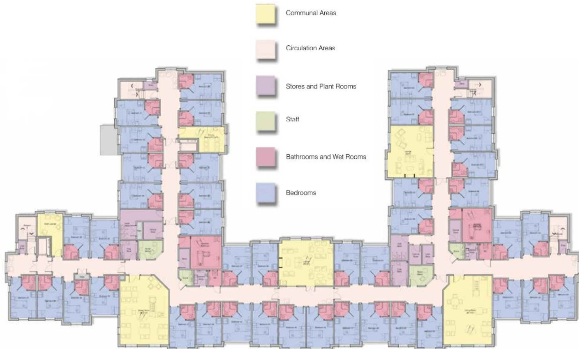
PROPOSED FIRST FLOOR