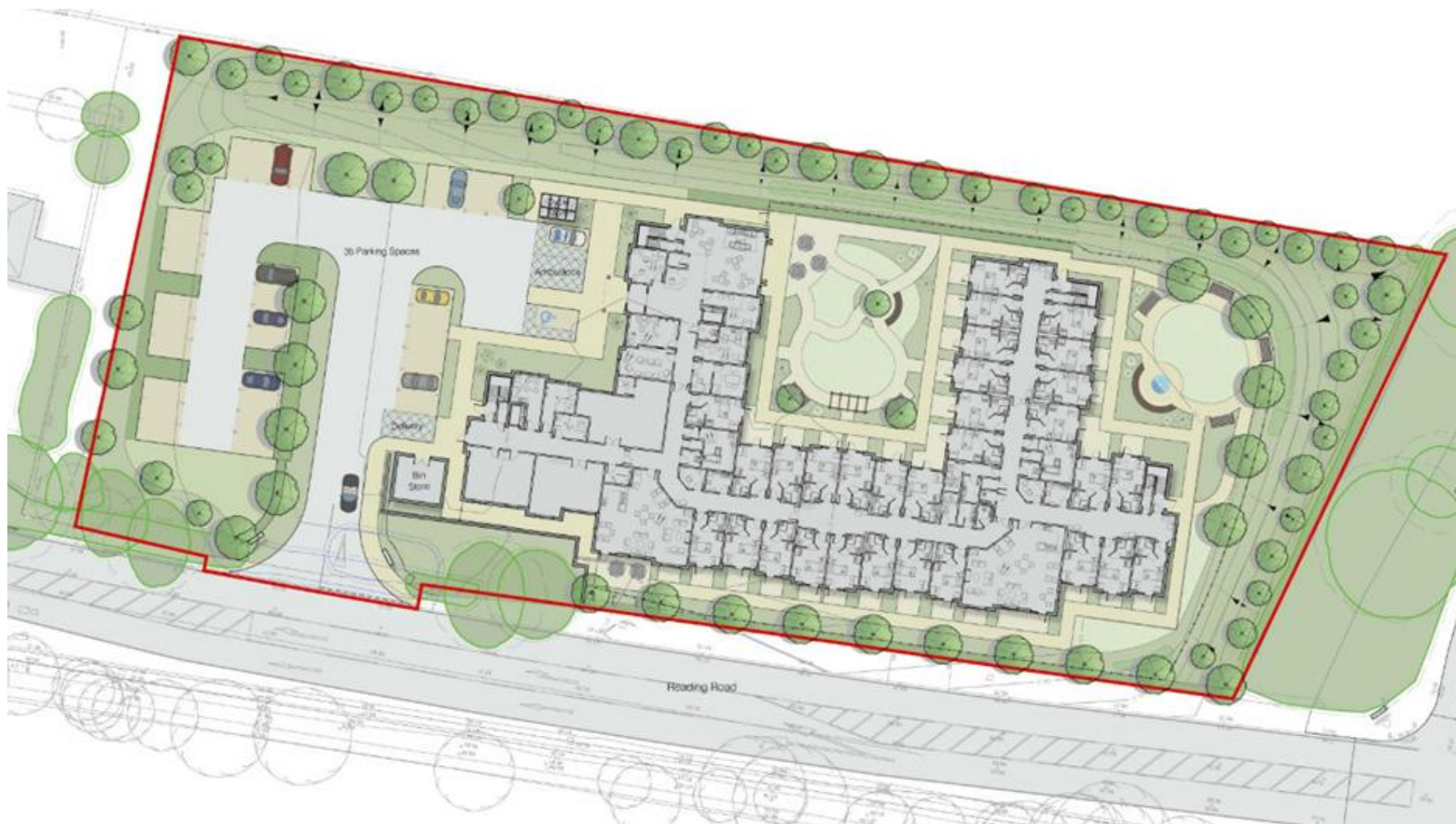
PROPOSED SITE PLAN (in full)