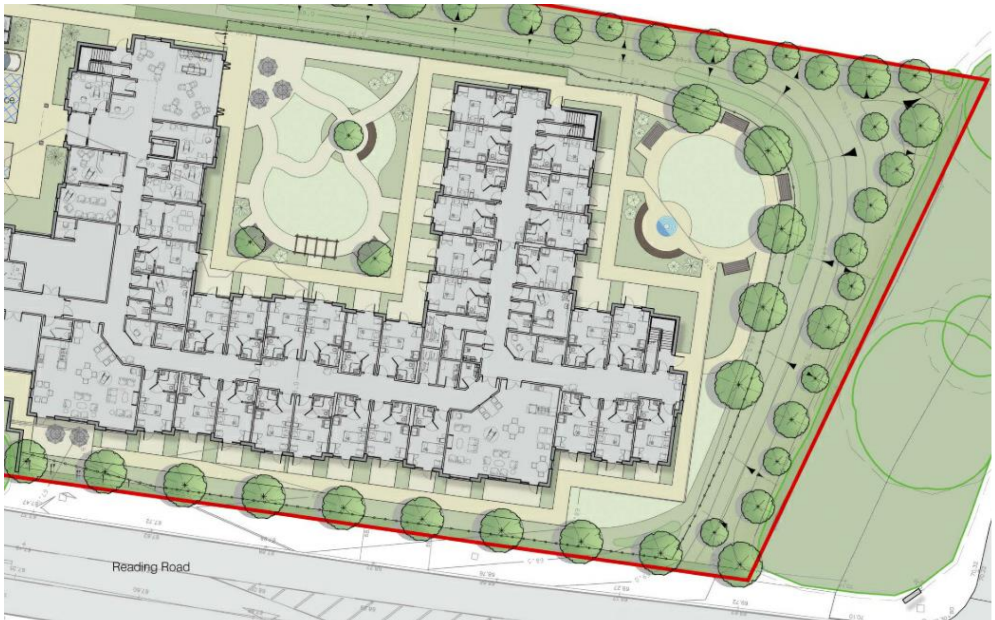
PROPOSED SITE PLAN (southern half)